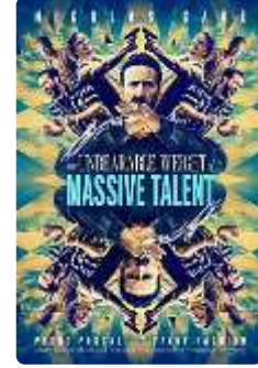
The Unbearable Weight of Massive Talent (Lionsgate) 4/22/22 - Wide Official Teaser, Poster