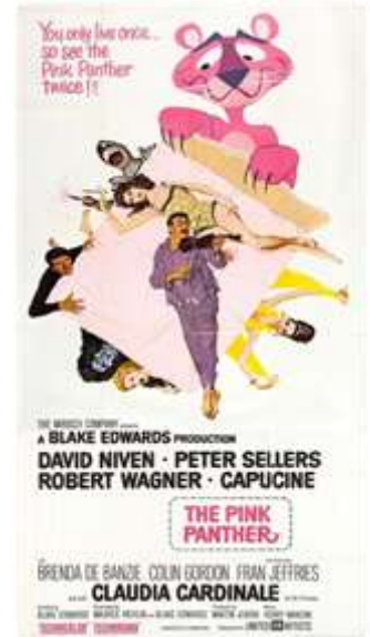
Final Car Chase Scene with Drivers in Gorilla and Zebra Suits - Click to Watch

It was, however, a film moviegoers loved. After opening in the U.S. March 18, 1964 via United Artists, it did nearly $11 million, a sizable total then. It spawned nine sequels from 1963-93 plus two reboot sequels in 2006 & 2009. PINK's animated Panther, designed by Hawley Pratt & Friz Freleng, wasn't seen in the movie, itself, but was in the titles for all but two of the films. However, the Panther starred in his own theatrical cartoon series -- starting with THE PINK PHINK, which won the short subject/cartoons Oscar in 1965 -- and also had a Saturday morning TV series from 1969-80.