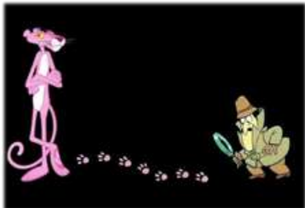
The 1963 Movie eventually spawned the Popular Saturday Morning Cartoon series Season 1, Episode 1 - Click to Play

"Crazy...Certifiable...I think, had he not been Peter Sellers he very likely could have ended up in an institution, truly." - Blake Edwards