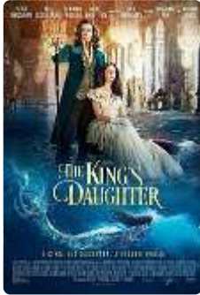
The King's Daughter (Gravitas Ventures) 2/21/22 - Limited Official Trailer, Poster