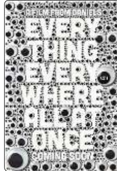
Everything Everywhere All at Once (A24) 3/25/22 - Limited Teaser Trailer, Poster