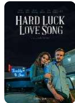
Hard Luck Love Song (Roadside Attractions) 10/15/21 - Limited Official Trailer

Screendollars · contactus@screendollars.com · (978) 494-4150