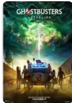
Ghostbusters: Afterlife (Sony) 11/19/21 - Wide Official Trailer, New Poster