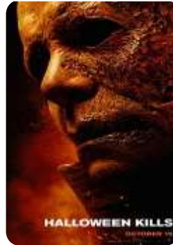
Halloween Kills (Universal) 10/15/21 - Wide Trailer #2