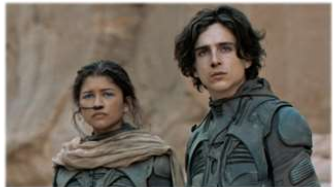
Warner Bros.’ Dune will open in China on 10/22

After a strong opening for Dune in other international markets, China announced this week that the Warner Bros. sci-fi hit would get a theatrical run in China as well, opening on October 22nd.