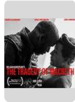
The Tragedy of Macbeth (A24) 12/25/21- Limited 1/14/22 - Apple TV+ Official Trailer