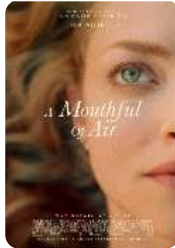
A Mouthful of Air (Sony Pictures Worldwide/Stage 6) 10/29/21- Wide First Trailer