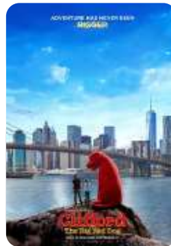
Clifford: The Big Red Dog (Paramount) 11/10/21 - Wide Teaser Trailer with previous release date