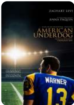
American Underdog (Lionsgate) 12/25/21 - Wide Official Trailer