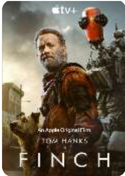
Finch (AKA: Bios) (Apple TV+) 11/5/21 - Select Theatrical/ Streaming Official Trailer