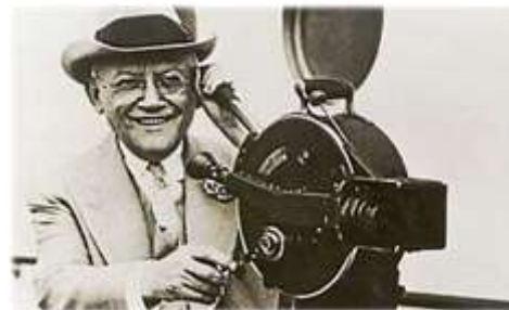
Hollywood Pioneer Carl Laemmle - Click to Play

If it weren't for Carl Laemmle, Hollywood might never have had movie stars. Laemmle, who died Sept. 24, 1939 at 72, came to America from Laupheim, Germany in 1884. He was managing a men's clothing store in Oshkosh, Wisconsin in 1906 when he became fascinated with nickelodeon parlors, where people would pay 5 or 10 cents to view moving images in machines. In a few years, he was distributing movies, which led to producing them through Independent Moving Pictures -- IMP, for short -- which he founded in 1909. IMP's offices were in New York and its films were shot in Ft. Lee, New Jersey.