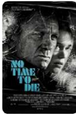
No Time To Die MGM/Universal/UAR 10/8/21 - Wide Final Trailer

A con artist decides to hide from an assassin inside a small-town police station. When the hit man turns up at the precinct, an unsuspecting rookie cop finds herself caught in the crosshairs. Joe Carnahan-D (Smokin' Aces, Point Blank, Death Wish, Bad Boys For Life, The A-Team, El Chicano.