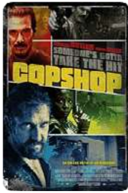
Copshop Briarcliff/Open Road 9/17/21 - Wide Trailer #1

A con artist decides to hide from an assassin inside a small-town police station. When the hit man turns up at the precinct, an unsuspecting rookie cop finds herself caught in the crosshairs. Joe Carnahan-D (Smokin' Aces, Point Blank, Death Wish, Bad Boys For Life, The A-Team, El Chicano.