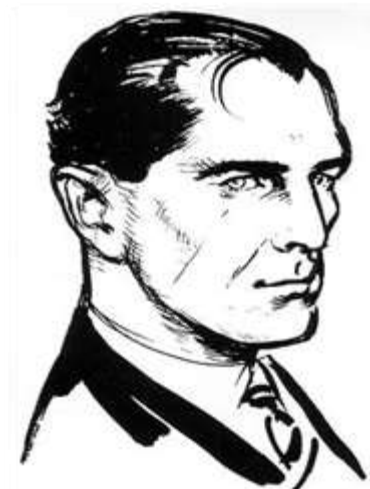
Sketch Done for Ian Fleming to Depict How James Bond Should Look

Back at their London offices, Broccoli sent Picker some possibilities -- like Patrick McGoohan, who was popular at the time from starring in the British TV spy series "DANGEROUS;" and a promising young actor, Robert Shaw, who later wound up being cast as a villain Bond battles in 1963's "FROM RUSSIA WITH LOVE."