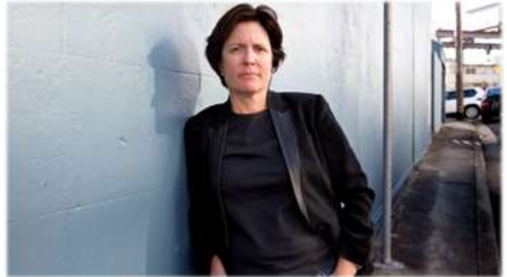
NY Times Journalist Kara Swisher