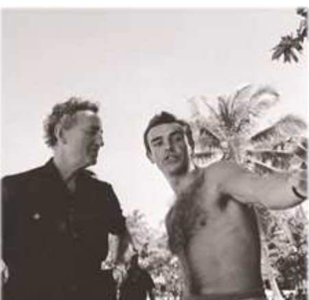
Fleming & Connery in Jamaica During the Filming of "DR. NO" - Click to Play

Then Picker heard from Saltzman, who flew to New York with film footage & stills of a young Scottish actor, Sean Connery, who'd already been in a few American movies. Picker, in his wonderful 2013 memoir "MUSTS, MAYBES, AND NEVERS," recalls asking Saltzman if Connery "was the best he could find" and being told, "He's the richest man in the poor house." They didn't think Connery was perfect for the role, but he met their needs.