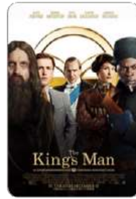
The King's Man 20th Century/Disney 12/22/21 -Wide New Red Band Trailer

Recruited to rescue a kidnapped scientist, globe-trotting spy James Bond finds himself hot on the trail of a mysterious villain, who's armed with a dangerous new technology. One of the best trailers of the year.