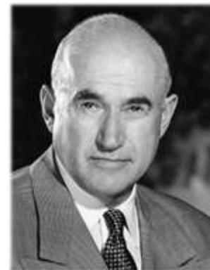
Click to Play

People recognize Goldwyn as Metro-Goldwyn-Mayer's middle name, but don't realize he was never part of MGM. Actually, Goldwyn wasn't even the legendary producer's birth name and August 27, 1882 wasn't really his birthday – although he always said it was. No one knows the real date, but it's agreed he was born in Warsaw and anglicized his name to Samuel Goldfish. In 1913, as a successful New York glove salesman, he became interested in making movies. With difficulty, Sam convinced his then brother-in-law, Jesse Lasky, that there was big money in films. They began by producing the first feature film ever made in Hollywood, The Squaw Man . Sam stayed in New York to sell the distribution rights.