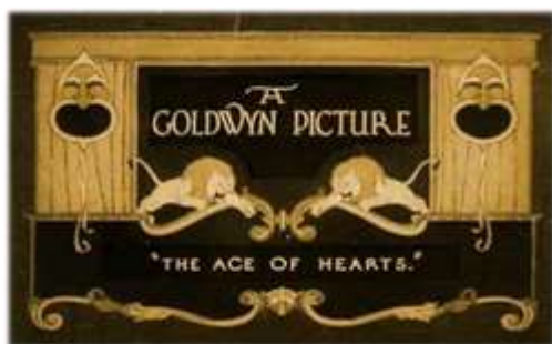
The “Leo” Logo of Goldwyn Pictures (1917-24)

Samuel Goldwyn: “Greater than ever. The only difference [today] is that people will not see the bad films. They can see that at home on television for nothing.”