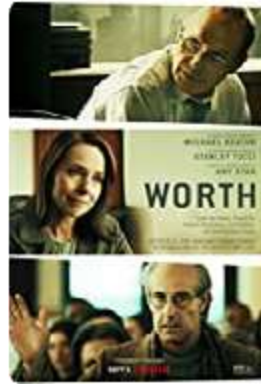
Worth (Netflix) 9/3/21 – Streaming Official Trailer

The saga of the Eternals, a race of immortal beings who lived on Earth and shaped its history and civilizations. Action Adventure Drama.