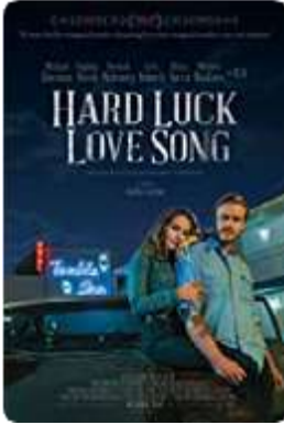
Hard Luck Love Song (Roadside Attractions) 10/15/21 – Wide Teaser Trailer

A gritty love story about a charismatic but down-on-his-luck troubadour living out of cheap motels and making bad decisions. Drama Music Romance.