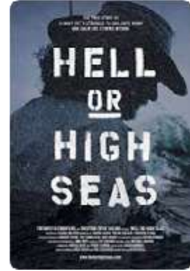
Hell or High Seas (Invincible Ent.) 10/8/21 – Limited Official Trailer

An attorney in Washington D.C. battles against cynicism, bureaucracy and politics to help the victims of 9/11. Biography Drama.