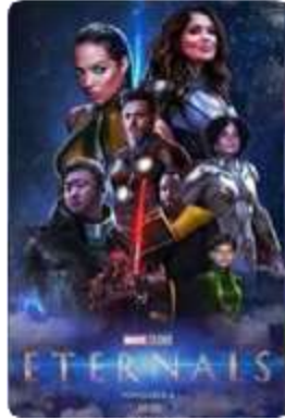
Eternals (Disney/Marvel) 11/5/21 – Wide Final Trailer

A gritty love story about a charismatic but down-on-his-luck troubadour living out of cheap motels and making bad decisions. Drama Music Romance.