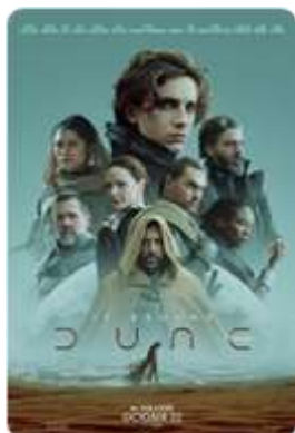
Dune (Warner Bros.) 10/22/21 – Wide Newest Trailer

Led by one of the most comprehensive marketing campaigns in movie history, Dune's mind blowing spectacular visuals, Hans Zimmer's soundtrack and story combine to bring the beloved science fiction novel to life as never before.