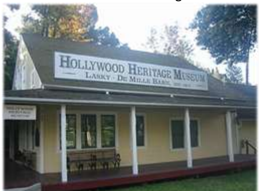
Lasky-DeMille Barn - Filming Location for DeMille's THE SQUAW MAN (1914) - Click to Play

Lasky & Goldfish pre-sold "SQUAW" for $43,000 in distribution fees. When they screened it, the images jumped wildly on the screen -- a total disaster. They turned for help to Philadelphia film pioneer Sigmund Lubin, who in return for their print business, fixed the problem. The perforations were out of synch from two different cameras having been used.