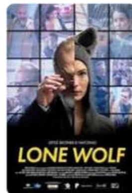
Lone Wolf (Gravitas Ventures) 9/24/21 – Limited/VOD Official Trailer