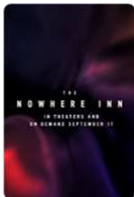
The Nowhere Inn (IFC Films) 9/17/21 – Limited Official Trailer

Directed by Denis Villeneuve (Arrival, $100M domestic box office) there is no question this is the movie like no other this fall.