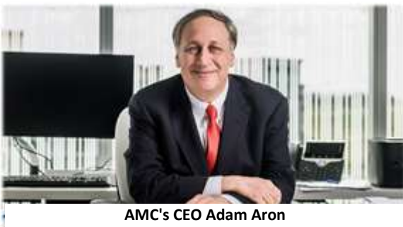
AMC’s CEO Adam Aron

See also: Regal Owner Cineworld Sees First-Half Revenue Dive, Is Eyeing Stock Listing In New York (Deadline) and Warner Bros., AMC Strike 45-Day Exclusive Theatrical Window Deal for 2022 (Hollywood Reporter)