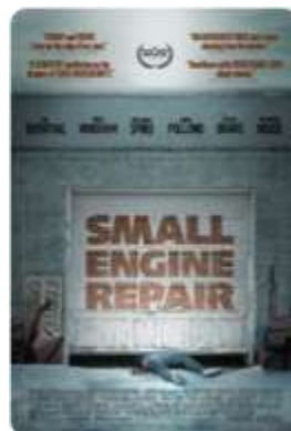
Small Engine Repair (Vertical Entertainment) 9/10/21 – Limited/VOD Official Trailer