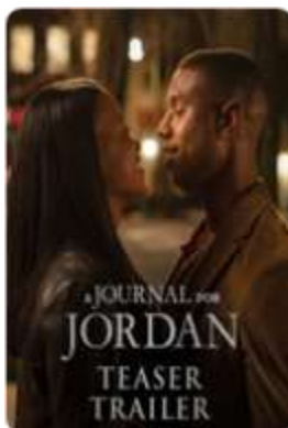
A Journal for Jordan (Sony/Columbia) 12/10/21 – NY/LA 12/22/21 – Wide Exp. New Trailer

Two creative forces band together to make a documentary about St. Vincent's music and life. However, they soon discover unpredictable forces lurking within subject and filmmaker that threatens to derail their friendship and the project.