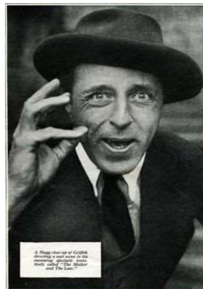
D.W. Griffith, Master of Cinema

That's how movie careers started in those days. By June 1909, Griffith was Biograph's top director and was constantly besieged by actors looking for work. With that in mind,