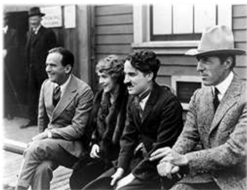
United Artists Founders Douglas Fairbanks, Mary Pickford, Charlie Chaplin and D.W. Griffith

16 year old Gladys Smith visited Biograph. As the receptionist delivered her usual speech about how busy Mr. Griffith was, she noticed the girl's blonde curls and added, "but he might take the time to see you, my dear." Fate intervened here, too, having Griffith walk by just then and stop to see who'd so impressed the tough-as-nails receptionist. He hired Gladys for a film already shooting. Before long, she was, herself, a movie star -- now called Mary Pickford.