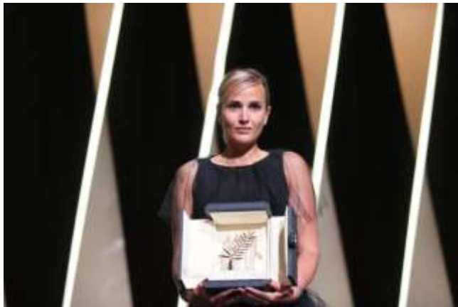
French Director Julia Ducournau accepts the Palme d'Or at the 2021 Cannes Film Festival

Now that studios are once again releasing their premium films and attendance is beginning to rebound, most exhibitors are dialing back their efforts to promote private rentals. However, some exhibitors have begun to experiment with renting out their auditoriums for video game tournaments or live events, in addition to dedicated film screenings. These