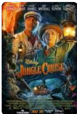
Jungle Cruise (Disney) 7/30/21 - Wide Final Trailer