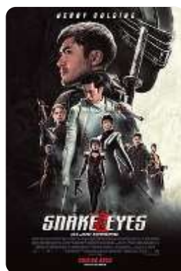
G.I. Joe: Snake Eyes (Paramount) 7/23/21 - Wide Official Trailer