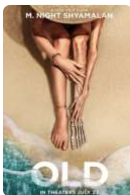
Old (Universal) 7/23/21 - Wide Official Trailer