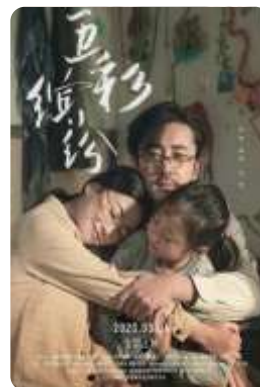
Confetti (DADA Films) 8/13/21 - Limited Official Trailer

Screendollars · contactus@screendollars.com · (978) 494-4150