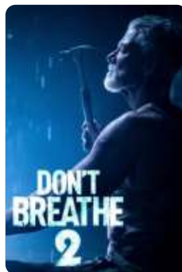
Don't Breathe 2 (Sony/Screen Gems) 8/13/21 - Wide Official Trailer