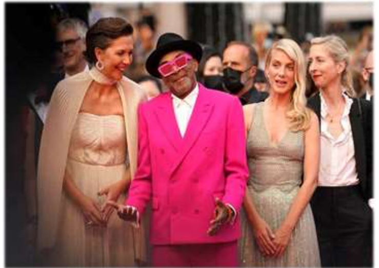
Jury members on hand at Cannes' opening night events, from left, Maaie Gyllenhaal, Spike Lee, Mélanie Laurent and Jessica Hausner.

See also: Cannes Film Festival Averaging 3 Positive Covid Cases Per Day From Thousands Of Tests (Deadline)