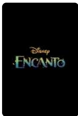
Encanto (Disney Animation) 11/24/21 - Wide Trailer #1