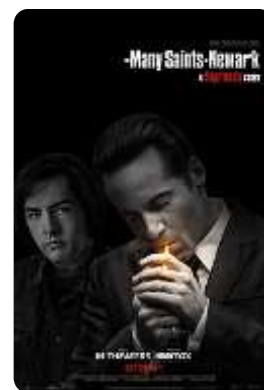
The Many Saints of Newark (Warner Bros./HBOMax) 10/1/21 - Wide Trailer #1