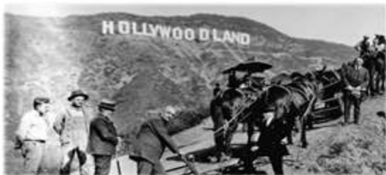
At the 1923 Dedication of the HOLLYWOODLAND Sign