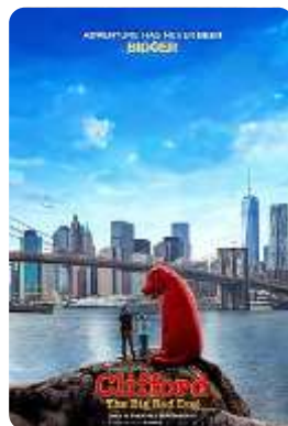
Clifford the Big Red Dog (Paramount) 9/17/21 - Wide Official Trailer