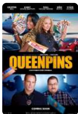
Queenpins (STX Films) 9/10/21 - Wide Trailer #1