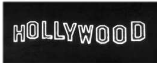
The HOLLYWOOD Sign – Click to Play

As the Depression took its toll on 1930's America, the HOLLYWOODLAND investors' real estate development plans came to a halt. Without funds to maintain the sign, they abandoned it and before long it fell into disrepair. It wasn't until 1949 that the Hollywood Chamber of Commerce gave it a new lease on life, shortening it to HOLLYWOOD and cutting the light bulbs. By the 1960's, the sign was falling apart again. This time, help came from Playboy publisher Hugh Hefner and some wealthy friends, thanks to whom HOLLYWOOD still stands as a symbol of Hollywood.