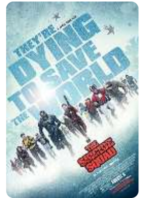
The Suicide Squad (Warner Bros./DC Comics) 8/6/21 - Wide Trailer #5