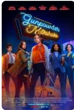
Gunpowder Milkshake (Netflix) 7/14/21 - Theatrical and Netflix Official Trailer