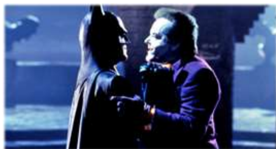
'Tell me something my friend. You ever danced with the devil in the pale moonlight?' - Click to Play

Happily, Burton's directing career took off as BATMAN opened to $40.5 million and did $251.2 million domestic. It spawned two sequels: BATMAN RETURNS (1992), reteaming Burton & Keaton and adding Danny DeVito as a new villain, Penguin ($162.9 million) & BATMAN FOREVER (1995), directed by Joel Schumacher with Val Kilmer as Batman and two new