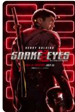
Snake Eyes (AKA: Snake Eyes: G.I. Joe Origins) (Paramount) 7/23/21 - Wide "Behind the Mask" Trailer