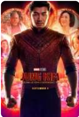
Shang Chi and the Legend of the Ten Rings (Disney) 9/3/21 - Wide Trailer #3