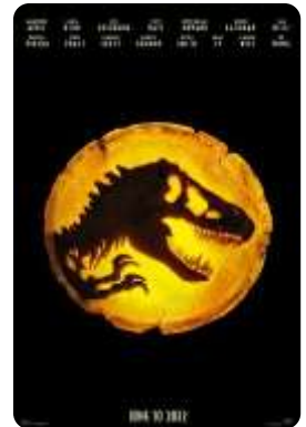
Jurassic Park: Dominion (Universal) 6/10/22 - Wide Teaser Trailer