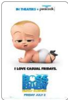
The Boss Baby: Family Business (Universal) 7/2/21 - Wide Screened Trailer #3