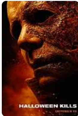
Halloween Kills (Universal) 10/15/21 - Wide Official Trailer