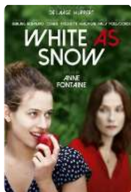
White as Snow (Cohen Media Group) 8/13/21 - Limited Comedy Drama Official Trailer