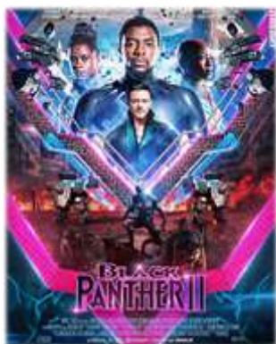
Black Panther: War for Wakanda (Disney/Marvel) 7/8/22 – Wide Action Fantasy Sci-Fi Adventure Official Trailer