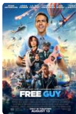
Free Guy (20th Century) 8/13/21 - Wide Action Comedy Fantasy Trailer 8