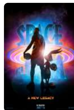
Space Jam: A New Legacy (Warner Bros./HBO Max) 7/16/21 - Wide Live Action CGI Comedy Trailer #2