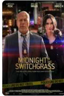
Midnight in the Switchgrass (Lionsgate) 7/23/21 - Limited Action Thriller Official Trailer