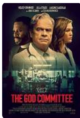
The God Committee (Vertical Entertainment) 7/2/21 - Limited Drama Official Trailer