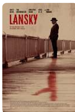
Lansky (Vertical Entertainment) 6/25/21 - Limited Crime Drama Official Trailer