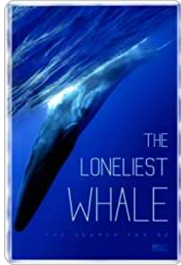
The Loneliest Whale (Bleecker Street) 7/9/21 - Limited Documentary Official Trailer