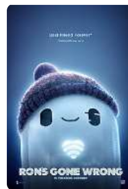
Ron's Gone Wrong (20th Century) 10/22/21 - Wide Animation Comedy First Trailer

Screendollars · contactus@screendollars.com · (978) 494-4150