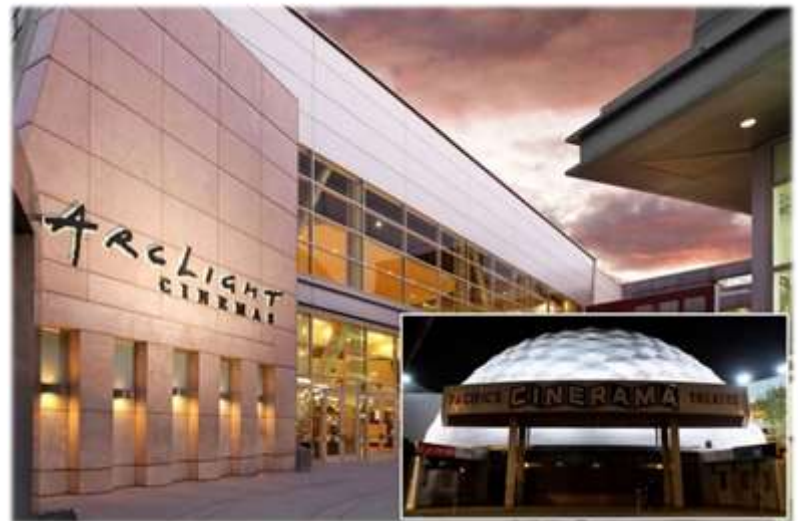
AMC is reported to be interested in acquiring the shuttered Pacific Theatres and ArcLight Cinemas locations in Southern California