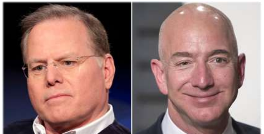
Warner Bros. Discovery's CEO David Zaslav & Amazon's Founder and CEO Jeff Bezos

Over the past month, two thunderbolts have crashed down on Hollywood and shaken the foundations of the movie business. Four weeks ago, AT&T made a surprise announcement that it would spin off its WarnerMedia division and merge it together with Discovery Networks to create Warner Bros. Discovery. The very next week, Amazon concluded its long-rumored pursuit of MGM, spending $8.45B to acquire the studio to bolster the content offerings for the e-commerce powerhouse. Additional mergers may well follow, as the major players in global entertainment jockey to reach consumers across all channels, geographies and formats.