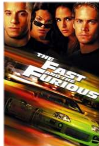
The Fast and The Furious (2001) Click to Play

Although the first FAST was an original, its title had already been seen on movie screens on a low budget 1955 crime drama marking the directorial debut of then 28-year-old and now legendary indie filmmaker Roger Corman. When Cohen was developing FAST, which is not a remake of Corman's film, he decided Corman's title would be perfect for his movie. So Cohen