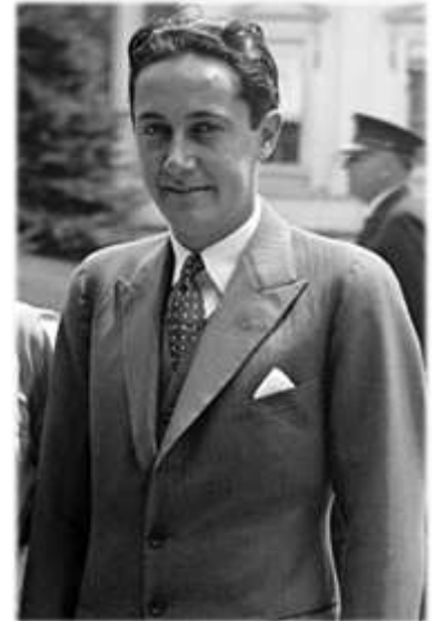
Irving Thalberg, MGM's "Boy Wonder" Click to Watch the Academy's Tribute presented at the 1987 Oscars