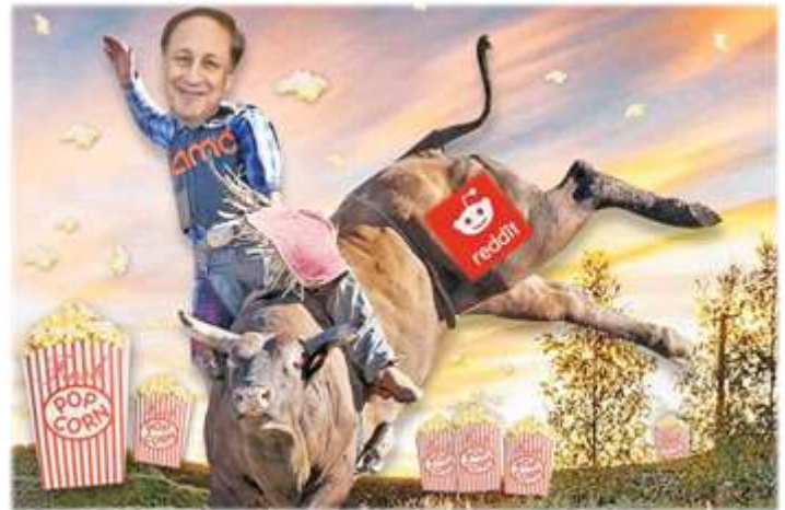
AMC's CEO Adam Aron

The Reddit Rallyers are at it again! This week, shares in AMC Theatres shot up, and down, and back up again on another wild ride fueled by day traders who follow Reddit's WallStreetBets investment forum, which traffics in hot stock tips. In fact, on Friday AMC was the most heavily traded stock on the New York Stock exchange, with over 650 million shares changing hands, more than six times its average monthly trading volume of 106 million. The price of AMC shares has increased by 1,132% during the five months of 2021, as investors seek to capitalize on prospects for a resurgence of revenues at the world's largest exhibitor. This hyperactive trading and stock price fluctuations are also driven by dynamics that are endemic to rapid trading cycles, and not necessarily based on a clear-eyed assessment of the long-term