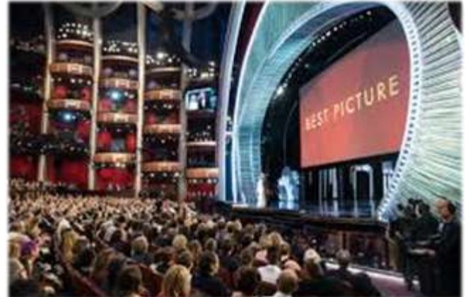
The Dolby Theatre will once again host the 94 th Academy Awards

Whereas the modified and delayed Oscars from 2021 were a poignant reminder of the hobbled state of theatrical releasing during the pandemic, next year's event is shaping up to be a return to normal, hopefully with improved ratings.