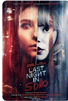
Last Night in Soho (Focus Features) 10/22/21 - Wide Official Teaser