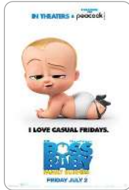
The Boss Baby: Family Business (Universal) 7/2/21 – Wide/Peacock TV (SVOD for 60 days) Official Trailer