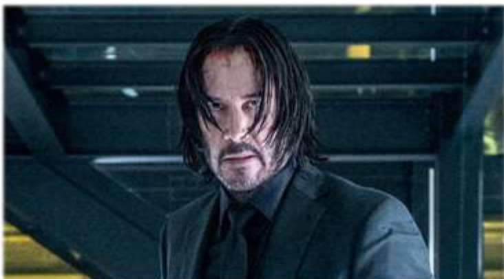
John Wick is one of Lionsgate's most popular movie franchises

The recent flurry of mergers and acquisitions among the top-tier of Hollywood studios, have industry watchers speculating that the few remaining mid-size studios such as Lionsgate will be the next targets for consolidation. Lionsgate has many traits that make it appealing, including its strength in streaming with Starz to its ownership of lucrative franchises such as John Wick and The Hunger Games . The post-pandemic return of exhibition should also strengthen its balance sheet, and value. Lionsgate has already shown success in theatres this spring, with successful May 13 th release of Spiral and optimism for the June 12 th release of The Hitman's Wife's Bodyguard .