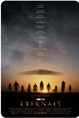
Eternals (Disney/Marvel) 11/5/21 - Wide Teaser Trailer #1