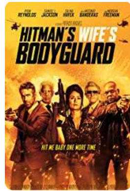
The Hitman's Wife's Bodyguard (Lionsgate) 6/16/21 - Wide Final Trailer