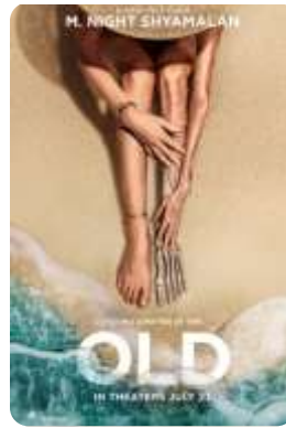
Old (Universal) 7/23/21 – Wide Official Trailer