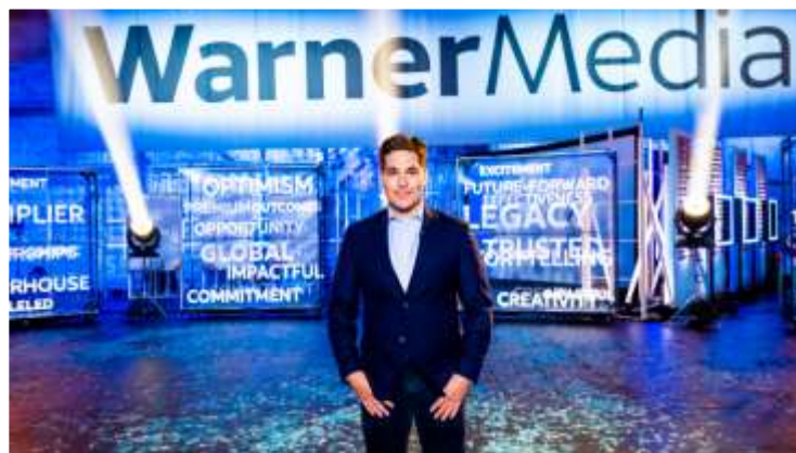
WarnerMedia's CEO Jason Kilar

According to reporting by the New York Times, Kilar was blindsided by the merger, with the announcement coming awkwardly on the day after the Wall Street Journal published a profile of Kilar and his leadership and strategy for WarnerMedia. Kilar's one-year tenure as the head of WarnerMedia has been controversial, due to his singular focus on streaming, often at the expense of traditional models for film distribution. His decision to release Warner Bros.' entire 2021 film slate simultaneously to theatres and through the company's in-house HBO Max streaming service prompted howls from exhibitors and talent. However, it has also had its intended results with significant growth in the number of HBO Max subscribers. Ironically, WB has also delivered the best box office performances of the pandemic period, since Warner Bros. films were among the relatively few big-budget commercial films that Hollywood delivered to theatres during the pandemic. Movie lovers flocked to commercially appealing films such as Wonder Woman 1984 and Godzilla Vs. Kong both on-line and in-theatres.