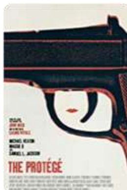
The Protégé (Lionsgate) Opens 8/20/21 - Wide Trailer #1