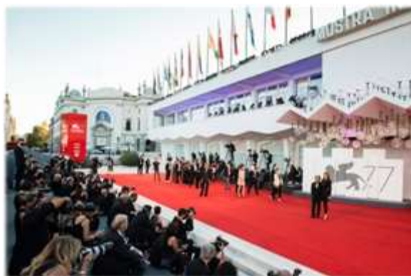
Stars arriving at the 77th Venice Film Festival in September 2020

A fascinating debate is taking place among the organizers of major film festivals on whether to resume operations as exclusive in-person events, or instead to broaden them to also accommodate remote attendees and screenings. Sundance announced that its 2022 edition would continue to offer a mix of in-person and virtual screenings, as it did earlier this year. Sundance 2021 attracted over twice the number of attendees than the in-person festival had in prior years. This hybrid in-person and virtual format was also followed at the 2020 Toronto International Film Festival, where it also expanded audience numbers and engagement. TIFF has also announced its plans to continue this format for 2021.