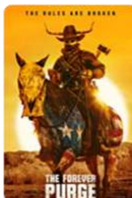
The Forever Purge (Universal) Opens 7/2/21 - Wide Official Trailer