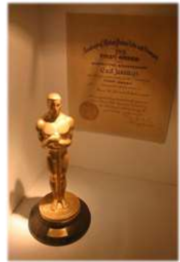
Emil Jannings' Best Actor award from the 1 st Academy Awards

Best actress went to Janet Gaynor for "7th Heaven", "Street Angel" and "Sunrise." Charlie Chaplin was nominated for Best Comedy Director, Actor & Writer for The Circus, but his unpopularity in Hollywood reportedly led to him being un-nominated and given a Special Award instead. Emil Jannings, who wasn't present, won Actor for "The Last Command" and "The Way of All Flesh."