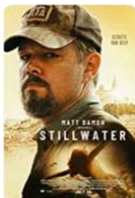
Stillwater (Focus Features) Opens 7/30/21 - Wide Official Trailer