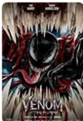
Venom: Let There Be Carnage (Sony/Marvel) Opens 9/24/26 - Wide Newest Version