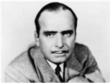
Douglas Fairbanks hosted the ceremony held before 250 guests at the Hollywood Roosevelt Hotel

If a 15 minute ceremony for just 250 people and no sealed envelopes sounds underwhelming, it's worth noting that when MGM mogul Louis B. Mayer came up with the idea for the Academy in 1927 it wasn't to bestow awards. What Mayer needed