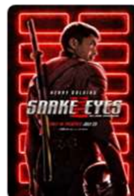
Snake Eyes (Paramount) Opens 7/23/21 - Wide Teaser Trailer Available Monday