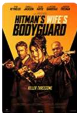
The Hitman's Wife's Bodyguard (Lionsgate) Opens 6/16/21 - Wide Trailer #2