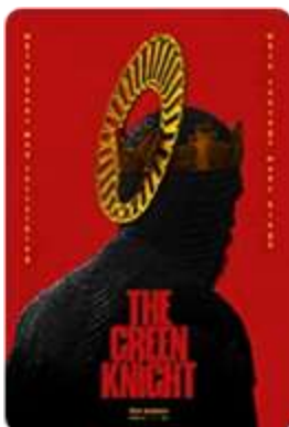
The Green Knight (A24) Opens 7/30/21 - Wide Official Trailer