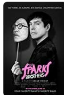
The Sparks Brothers (Focus Features) Opens 6/16/21 - Moderate Official Trailer