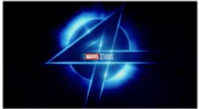
Marvel Studios Sizzle Reel, entitled “See You at the Movies!” Click to Play

We sample these two inspirational stories which aired recently on National Public Radio, considering the impact of the re-opening of movie theatres and the return of Hollywood blockbusters to the big screen. As the pandemic lifts and life in public resumes, this renewal is being experienced at more than 5,000 U.S. cinemas across the U.S. and all around the world. It’s hard to resist the appeal of a night out at the movies.