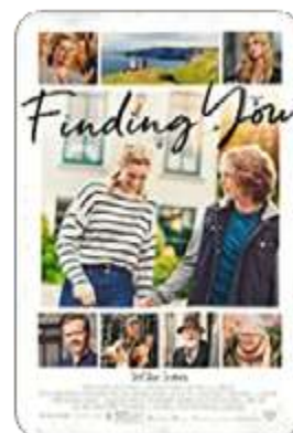
Finding You (Roadside Attractions) Opens 5/14/21 Featurette