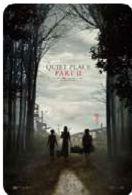
A Quiet Place Part II (Paramount) Opens 5/28/21 Final Trailer