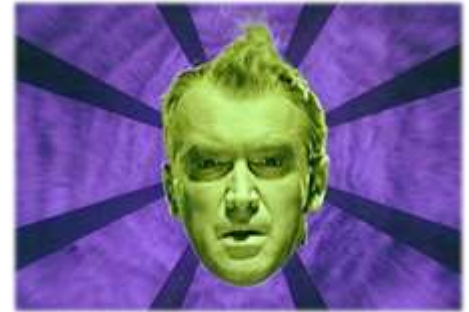
"Scottie's Nightmare" Scene from Hitchcock's 1958 Masterpiece Vertigo

In those days, thrillers didn't mean "horror films" to audiences as they now do. Thrillers were mainstream adult appeal mysteries that in good hands – especially, Hitchcock's – kept moviegoers on the edge of their seats (non-reclining and not leather upholstered then). Since coming to Hollywood from England in 1940, the Master of Suspense, as Hitch later became known, had achieved ongoing success directing thrillers like Rebecca (1940), Dial M For Murder (1953), Rear Window (1954) and To Catch a Thief (1955). With Vertigo , he hit a bump in the road, at least at the time, after which he resumed making hits -- like North by Northwest (1959), Psycho (1960) and The Birds (1963).