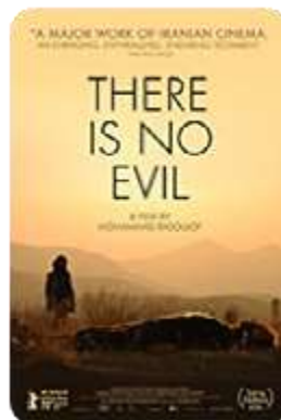
There is No Evil (Kino Lorber) Opens 5/14/21 Official Trailer