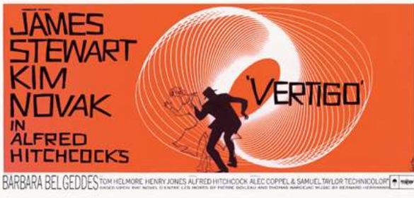
Theatrical posters and promotional graphics were designed by renowned graphic designer Saul Bass Click to Read More

Vertigo received Oscar nominations only for art direction and sound -- not for picture or directing or for Bernard Herrmann's haunting score. In fact, despite five directing noms over the years, Hitchcock never won an Oscar. Like fine wine, Vertigo needed time to mature – to be understood and appreciated. Over the years, a new generation of film critics recognized and applauded its uniqueness. In 2007, it joined the top ranks of Hollywood classics when the American Film Institute ranked it the ninth best American movie of all time. Its ultimate recognition, however, came in 2012 when in the British Film Institute's Sight & Sound critics poll it replaced Citizen Kane as the greatest film ever made.