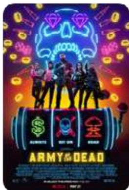
Army of the Dead (Netflix) Opens 5/21/21 Official Trailer