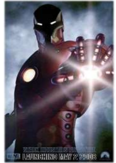
Iron Man Suits Up -Click to Play

We've already seen three phases of the MCU and are now entering the fourth. Phase One began with IM and ended with the first crossover film The Avengers (2012). Phase Two started with IM3 (2013) and wrapped up with Ant-Man (2015). Phase Three got going with Captain America: Civil War (2016) and culminated in Spider-Man: Far from Home (2019 via Sony). Phase Four kicks off 7/9 with Black Widow , followed by Shang-Chi and the Legend of the Ten Rings (Sept. 3), Eternals (Nov. 5) and Spider-Man: No Way Home (Dec. 17).