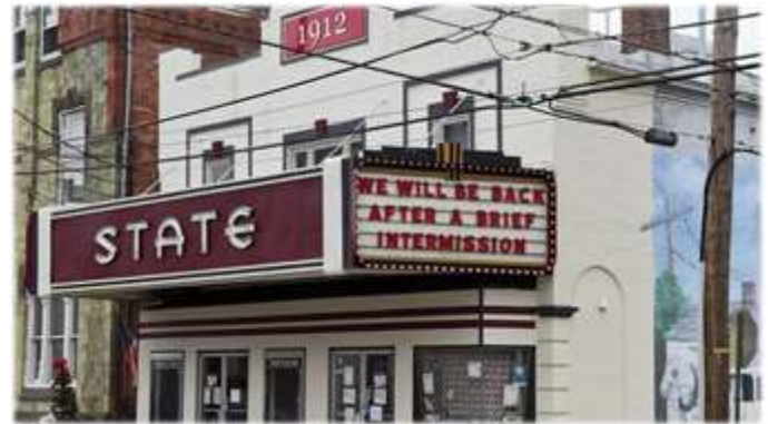
The State Theatre in Boyertown, Penn. photographed on Jan. 4, 2021