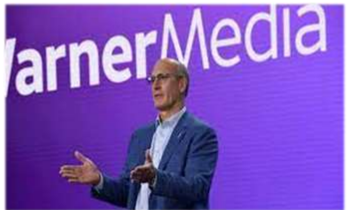
John Stankey, CEO of AT&T WarnerMedia

During Q1, Warner Bros. releases premiering on HBO Max included All the Little Things , Tom & Jerry and the much-hyped Zach Snyder cut of Justice League . Godzilla Vs. Kong debuted on the last day of the quarter, March 31 st , with a buzz that is expected to move the needle on new subscriptions.