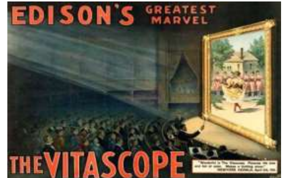
Film projection to large audiences was much more profitable than viewing through individual kiosks, since fewer machines were needed in proportion to the number of viewers - Click to Play

The first public Vitascope screening took place April 23, 1896 at Koster & Biel's Music Hall, a vaudeville house in New York's Herald Square at 34th Street near Broadway, the site today of Macy's. It would have premiered three days earlier, but it took longer than expected to install the machinery. That first night audience was dazzled by film images projected on a 20 foot canvas screen set within a gilded frame. What they saw is detailed in Terry Ramsaye's 1926 film history book A Million and One Nights : "...a dash of prize fight, several dancing girls who displayed their versatility to the camera and... the surf at Dover, England (which the audience thought was) from down the New Jersey coast." To this very day, sex, violence and