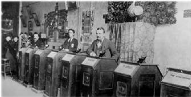
Watching movies at a Kinetoscope Parlor in San Francisco, 1895

spectacle are still attracting movie audiences. Projection caught on immediately, but the Vitascope didn't last. Once Edison recognized the business advantages of projection vs. peep shows, Vitascope found itself with no new films to show. Early audiences wanted to see new films after they'd seen the first ones. Vitascope's original celluloid film strips wore out from repeated projection and it didn't have new product -- but Edison and others at the time did. As the movie industry developed, early exhibitors saw the value of going into production to guarantee they'd always have enough product to show. Now, about 125 years later, nothing's changed. Exhibitors and studios still need each other to make the film business work.