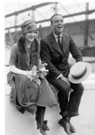
Mary Pickford and Douglas Fairbanks, on their Honeymoon in London, 1920 – Click to Play

Mary Pickford and Douglas Fairbanks became Hollywood's first power couple when they married 101 years ago on March 28, 1920. Pickford and Fairbanks had already established themselves as leading stars of the silver screen, with the public dubbing her "America's Sweetheart" for her charming performances in films such as Rebecca of Sunnybrook Farms (1917) and calling Fairbanks "Everybody's Hero" for his swashbuckling roles in films like The Mark of Zorro (1918). The year before they married, they also became business partners by joining with Charlie Chaplin and director D.W. Griffith to create United Artists. Filmmakers who signed on at UA were true independents attempting to take control of the destiny of their films. This was in great contrast to how films made by the major studios were controlled by their production heads or founders – like Adolph Zukor at Famous Players-Lasky, which later became Paramount Pictures. Mary worked for Zukor for many years as her star power grew. In May 1916, she signed a new deal with Zukor that gave her complete control of her projects, including a $10,000 weekly salary plus 50% of each film's profits with a guarantee of more than $1M - about $18.5M today.