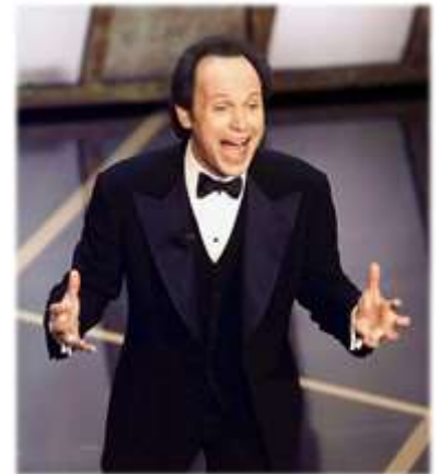
Billy Crystal hosted the 70 th Oscars, making his 6 th turn at the helm Click to Watch

Since then, much has changed on the Oscars front with Academy members embracing films for Best Picture that are driven more by critical acclaim than by box office success. Audiences for awards shows in general declined sharply as viewers became increasingly less familiar with the nominees – frequently because specialty films hadn't played in theatres in smaller markets across the country. More recently, the rise of streaming Studios like Netflix and Amazon has led to many Oscar nominees with little or no