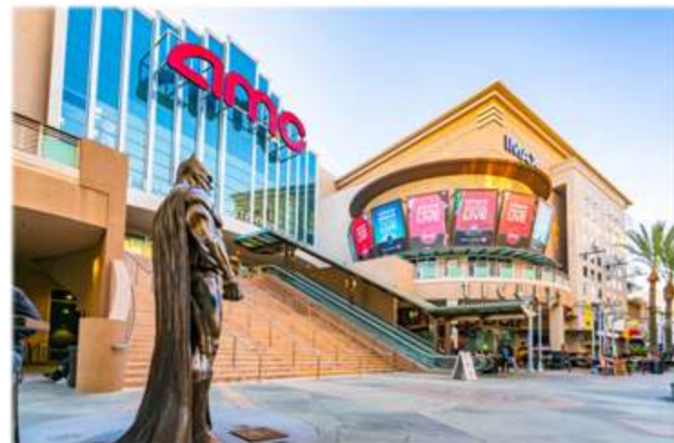
AMC Burbank 16 and the Batman bronze statue in Burbank, CA

AMC Theatres, the largest movie theatre operator in the world, announced that as of last Friday it had reopened 98% of its 630 cinema locations in the U.S., including 52 of its 54 locations in California. A key milestone in the reboot of exhibition came when L.A. County lifted its "Safer at Home" emergency orders earlier this month, allowing movie theatres to re-open with limited capacity after one year of forced closures. The largest U.S. exhibitors have taken different approaches to navigate the challenges presented by the pandemic. Regal, the second largest exhibitor in the U.S., has kept its locations closed throughout the pandemic, waiting for the return of big-budget studio releases ramping up its operations. On the other hand,