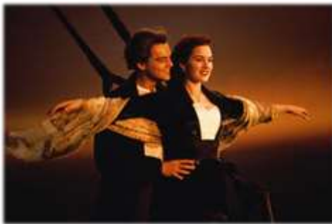
Leonardo DiCaprio and Kate Winslet in Titanic "I'm Flying!" - Click to Watch

theatrical exposure. Despite the streamers' large audiences, many television viewers aren't subscribers and, therefore, don't have a rooting interest in whether those films win. The global pandemic added to the problem by closing most cinemas last year, prompting studios to defer movie openings to 2021. Moviegoers saw few films and have understandably shown little interest in recent awards shows.