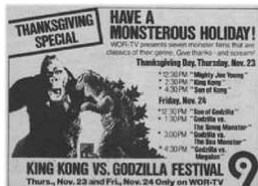
King Kong and Godzilla, longtime Headliners of the Annual Thanksgiving Special on New York's WOR-TV Click to Watch

On March 5, 1956, King Kong began a week-long run in the living rooms of New York when RKO's 1933 movie was broadcast by WOR-TV Channel 9 as a feature of its "Million Dollar Movie" series, famous for showing the same movie 16 times in a single week, twice every weekday evening and adding a third matinee showing on the weekend. It was the first time Kong had appeared on the small screen and he was an instant hit. WOR transformed this early success to create a classic annual series for Thanksgiving Week, showing King Kong movies on Thanksgiving Day followed by Godzilla movies on Friday. King Kong and Godzilla were natural movie stars, and remain so to this day. Witness Warner Bros.' upcoming release of Godzilla Vs. Kong opening on March 25 th in theatres and on HBO Max streaming. In the early days of TV, movie studios were reluctant