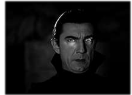
Welcome to Count Dracula’s Castle Click to Play

In popular culture, Valentine’s Day is a day for love and romance... how sweet...a card. But Hollywood has over the years sometimes come up with up with a chilling sub-plot, turning February 14 th into A Day of Horror . On Valentine’s Day in 1931, Universal Pictures released Dracula starring Bela Lugosi. The vampire character created by Bram Stoker’s in his 1897 novel had made its first appearance in the 1922 German Expressionist silent film Nosferatu . In 1927 Dracula was produced as a very successful play on Broadway starring Lugosi. He was chosen to reprise his performance in the 1931 film, the first movie with sound to feature Dracula, which established the vampire as an icon of horror movies. Newspapers reported that at its New York premiere members of the audience had fainted in shock at the horrible scenes they had witnessed, a quote which the studio used in its national promotional campaign.