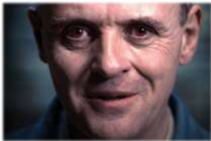
Hannibal Lecter Escapes - Click to Play