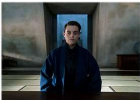
Rami Malek stars as Safin, the latest Bond villain in NO TIME TO DIE - Click to Play

This week saw a flurry of release date changes from major studios. The lynchpin came Thursday when MGM and United