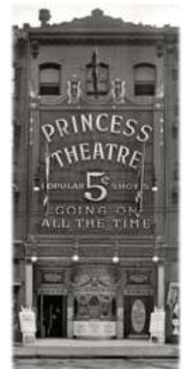
The Princess Theatre in Detroit was a classic Nickelodeon. These small, simple theatres were often set up in converted storefronts and charged five cents for admission. Their popularity exploded throughout the 1920s.

Our current COVID-19 crisis is not the first time that Hollywood has survived a pandemic. The Spanish Flu of 1918-1919 killed 50M worldwide, fueled by the conflict of WWI with the mustering and deployment of millions of troops and widespread dislocation of populations. Before the outbreak, Hollywood was ascending as a primary medium for mass entertainment, dazzling audiences with the spectacle of motion pictures played on screens at local Nickelodeons, Gems and Bijous across the country. For a time, the pandemic forced the closure of most theatres and film production in Hollywood. However, after the war had ended, the troops came home and the virus subsided, the movies once again surged in popularity. By the middle of the 20's, 50M American were going to the movies each week, the equivalent of one half the country's population. Why? Movies were fun, accessible and affordable, providing a diversion from the cares of daily life. By the late 20s, radio also began to take off, providing Americans with in-home entertainment for the first time. 100 years ago, neither a global pandemic nor the invention of radio managed to upend the movie business, founded on the appeal of a leaving the house to go to the movies with family and friends.