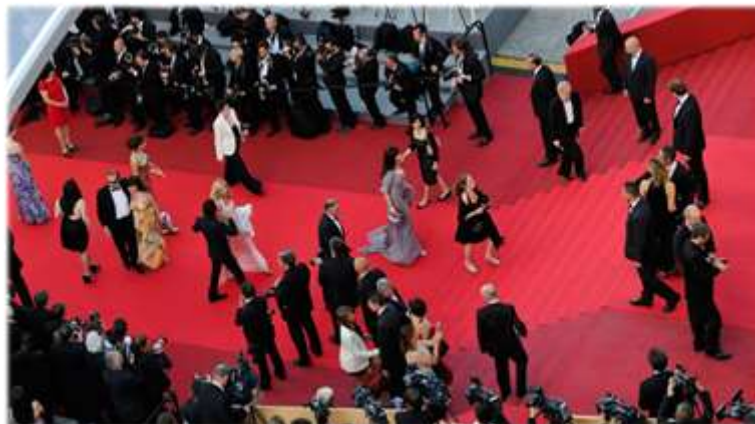
On the Red Carpet at the Cannes Film Festival

The 2021 Cannes Film Festival is currently scheduled to begin on May 11 th only 3 ½ months away. However, as the timeline extends for a general recovery from the coronavirus pandemic, it is looking increasingly unlikely that organizers will be able to hold to these dates. Last week, the Association of Hotel Operators in Cannes was notified that the festival would likely need to be postponed, with new dates set for mid-July. Last year, festival organizers announced in April only one month before its opening that the 2020 festival would be