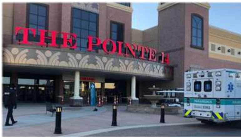
COVID vaccination clinic at Stone Theatres' The Pointe 14 in Wilmington, NC – Click to Play Video