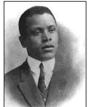
Oscar Micheaux, The Czar of Black Hollywood

In celebration of Martin Luther King’s birthday, we celebrate the 100-year history of films made by and for Black Americans. Hollywood’s early years coincided with a troubled period in America’s struggle to achieve racial equality. D.W. Griffith’s landmark film Birth of a Nation in 1915 set an ugly precedent with its portrayal of African Americans as unintelligent and inferior to the heroic Klansmen on a quest to preserve their vision of traditional American values. While counterprogramming from mainstream studios took decades to develop, Black filmmakers created their own counter point. The creative and entrepreneurial Oscar Micheaux became America’s pre-eminent Black filmmaker over his three-decade career beginning in 1918. Through more than 40 features, Micheaux portrayed the lives of Black Americans with a wide range of characters from heroes and heroines to scoundrels, told through dramas, comedies and even musicals. “Race films” from the period were mostly made by and for African Americans. "All-Negro" musicals of the 1940s and 50s including Stormy Weather , St. Louis Blues , and Porgy and Bess used song and dance to appeal to general (White) audiences, without asking too many hard questions.