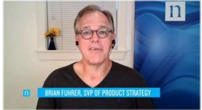
Nielson's Recap of 2020 SVOD - Click to Watch