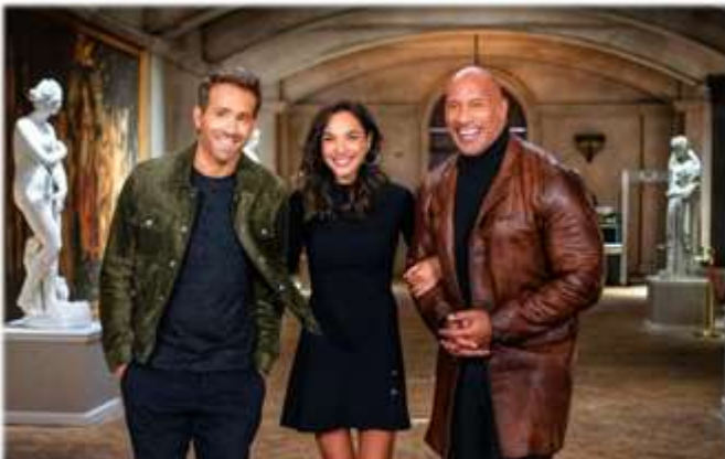
Netflix's upcoming RED NOTICE will star Ryan Reynolds, Gal Gadot and Duane Johnson