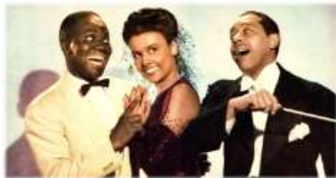
STORMY WEATHER (1943) , starring Bill Robinson, Lena Horne and Cab Calloway

Fred Astaire proclaimed the “Jumpin’ Jive” dance sequence in the film was the greatest movie musical number he had ever seen.