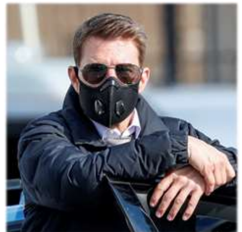
Tom Cruise went ballistic on the set of MI7, shouting at the crew to enforce compliance with COVID-19 safety protocols.

After brief pause over the holidays, studios have resumed filming on sets across Los Angeles County despite an alarming surge in coronavirus infections, with ten people testing positive for the virus every minute. The decision has been controversial, pitting the business imperatives of The Industry with the health imperatives of its workers and the community. Earlier this month during the pause in production, SAG-AFTRA's Gabrielle Carteris commented, "Patients are dying in ambulances waiting for treatment because hospital emergency rooms are overwhelmed. This is not a safe environment for in-person production right now." Since March, California has included film industry workers as part of the "essential workforce", thereby exempting them from mandatory stay-at-home orders. Studios claim that on-set safety protocols have been effective in minimizing risk and controlling transmissions. These measures include strict use of PPE, frequent testing and mandatory shut down of production when positive test